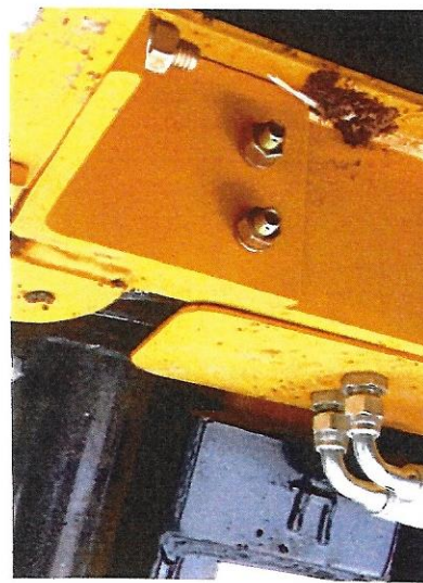
BOLT LOCK UP