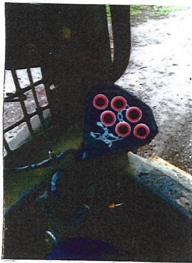
IN CAB CONTROLS