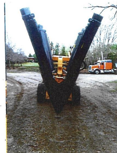
100% NYLON COVER