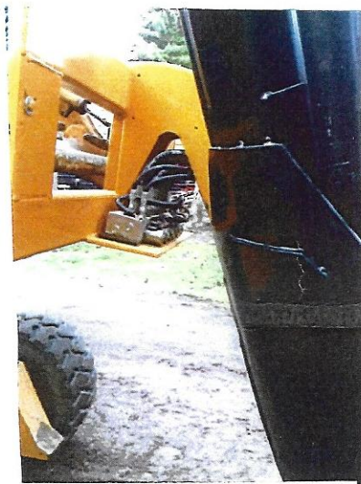
12 VOLT VALVES