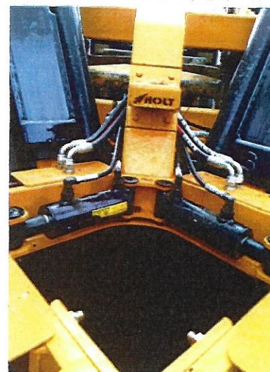
GATE OPEN CYL