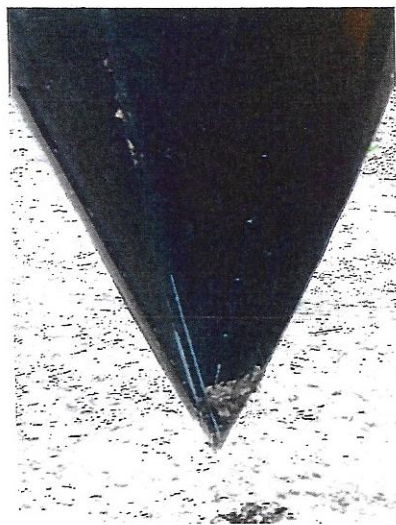
DIGS 44" DEEP