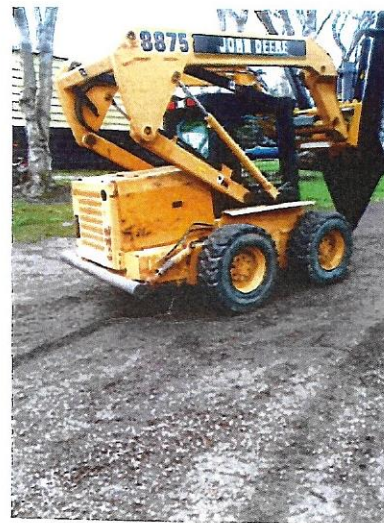
REQUIRE 300 LB