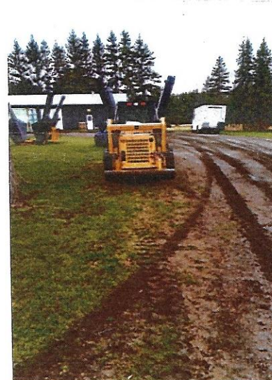
2500 LB LIFT OUT RIGGER