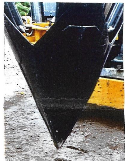
DIGS TREES IN SAND