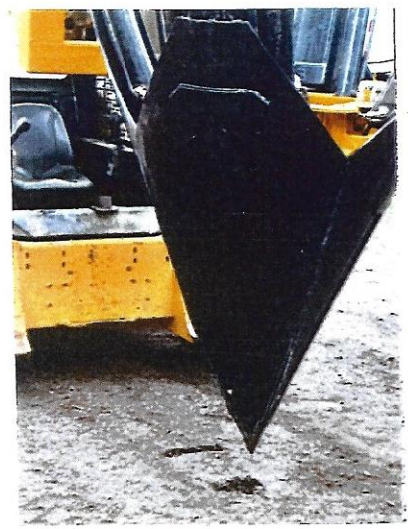
100% ROOT CUT