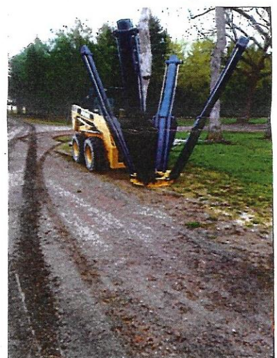
HT 90" WT 74" OPEN

JACK HOLT TREE STUMP EXTRACTOR PLUS COMBINATION 39" TREE SPADE FOR SAND